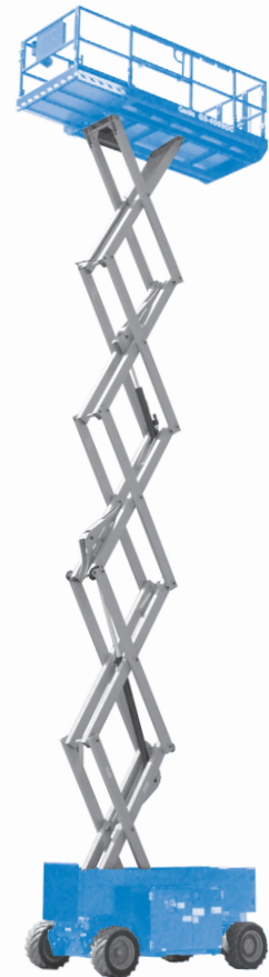
01/18 Part No. B127292UK